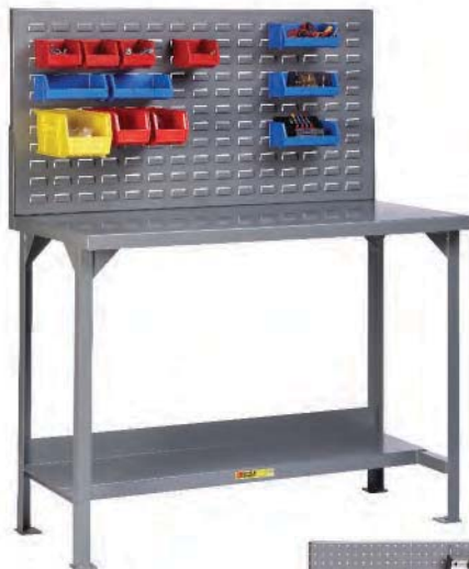
Lower Shelf Model with optional pegboard WST2-2448-36-LP

Locking Drawer 13" W x 17" D x 4-1/2" H (Mounted on right side). -DR