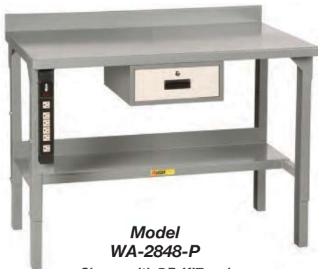
Model WA-2848-P Shown with DR-KIT and factory installed Power Strip