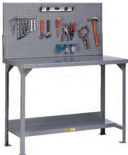
Lower Shelf Model with optional pegboard WST2-2448-36-PB