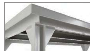
Underside supporting frame