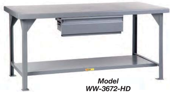
Model WW-3672-HD Shown with heavy-duty drawer

Heavy-Duty Welded Workbenches have an extra strong 7 gauge (0.180 inch) reinforced steel top with rounded comfort edges that can support up to 10,000 lbs. UDL. Heavy 2" x 2" angle legs are 1/4"-thick with welded 7 gauge gussets. The stationary models have footpads with a 5/8"-diameter anchor hole. A sturdy 12 gauge lower shelf has a 500 lbs. capacity for added storage. All models are welded and ship set up, ready for immediate use.