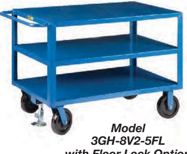
with Floor Lock Option