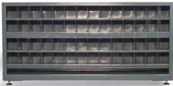
Product Number...7.13.3-248-1120P Overall Height...39" Width x Depth x Height... 85" x 24" x 39" Weight...838 lbs.

To help accommodate assembly lines and where multiple storage is needed, this cabinet is loaded with bin storage space. Bins are located on the back as well as the front. There are 56 openings on each side, measuring 6" wide x 6" high x 10" deep. We have added leg levelers to adjust your cabinet to an uneven surface.