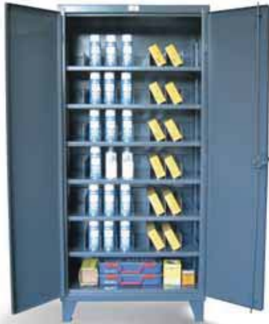
Product Number... 36-246PH/42VD

For the separation of your storage needs, we offer our floor model cabinet with 12-gauge adjustable dividers. Same sturdy construction as our standard 12-gauge cabinets except with more storage versatility.