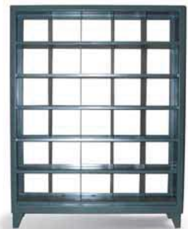
Product Number...56-NB-165-300P Overall Height...78" Width x Depth x Height... 60" x 16" x 72" Weight...611 lbs.

This pass thru bin rack is used in store rooms when doors aren't available to obtain small inventory parts. This item measures 60" wide x 16" deep x 72" high, overall height is 78." Each opening is 11" wide x 10" high. Other sizes available at your request.