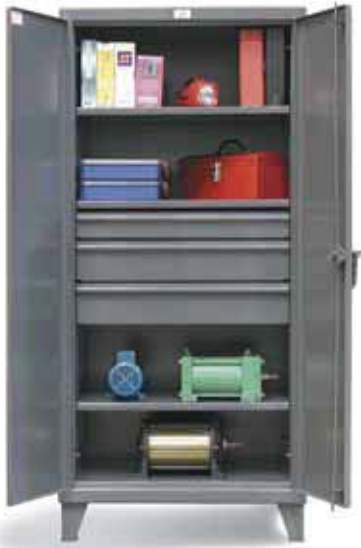
Product Number... ◆ 36-243-3DB Overall Height...78" Shelf P/N...3-24C Width x Depth x Height... 36" x 24" x 72" Weight...685 lbs.

These cabinets have the functional design and strength that can be used in any industrial environment. The drawers and shelves can handle small parts and bulk storage in one unit. Full extension drawers deliver payload capacity of 400 lbs. per drawer. Shelf capacity is up to 1900 lbs. per shelf. Other sizes can be manufactured.