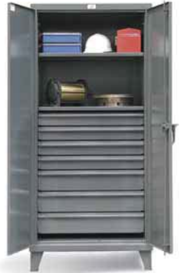
Product Number... ◆ 36-242-7DB Overall Height...78" Shelf P/N...3-24C Width x Depth x Height... 36" x 24" x 72" Weight .....828 lbs.