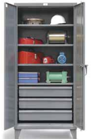
Product Number... ◆ 36-244-3DB Overall Height...78" Shelf P/N...3-24C Width x Depth x Height... 36" x 24" x 72" Weight...646 lbs.