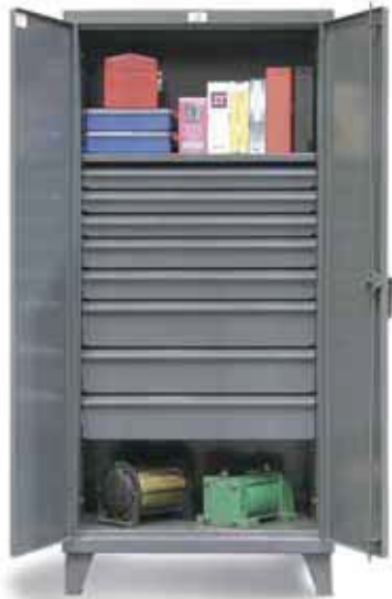
Product Number... ◆ 36-241-8DB Overall Height...78" Shelf P/N...3-24C Width x Depth x Height... 36" x 24" x 72" Weight...836 lbs.