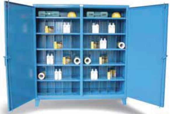
Product Number...66-DS-242-8PH/40VD-SB Overall Height...78" Width x Depth x Height...72" x 24" x 72" Weight...1126 lbs.

This two shift cabinet fits great in areas where space is limited. It has 2 locking handles and divided in the center. There are 40 adjustable dividers and more can be added. This cabinet is shown in Miller Blue. Other colors are available.