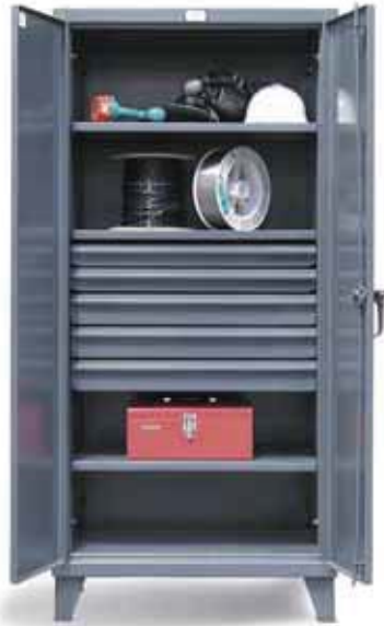
Product Number... ◆ 36-243-5DB Overall Height...78" Shelf P/N...3-24C Width x Depth x Height... 36" x 24" x 72" Weight...724 lbs.