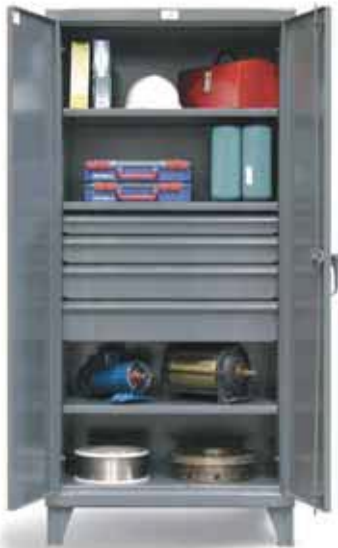
Product Number... ◆ 36-243-4DB Overall Height...78" Shelf P/N...3-24C Width x Height x Depth... 36" x 24" x 72" Weight...715 lbs.