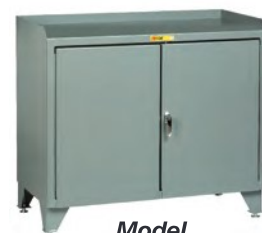
Model MB3-LL-2D-2448 Solid Doors

For Pegboard Panel, add: -PB For Louvered Panel, add: -LP