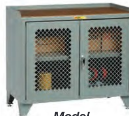
Model MHP3-LL-2D-2448 Clearview Doors