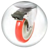
Available with Total Lock Casters