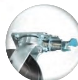
4 Position Swivel Lock