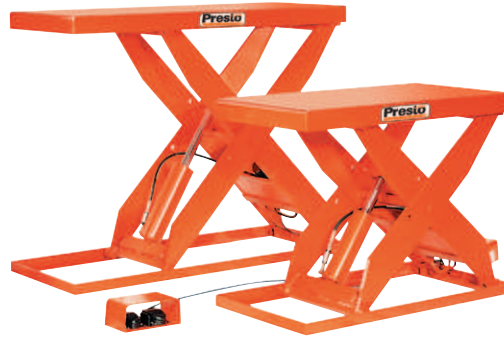
XL Series Standard Duty Scissor Lifts

Presto ECOA Lifts offers a full line of Hydraulic Scissor Lift Tables with capacities up to 12,000 lbs., available in: Light Duty; Standard Duty; Heavy Duty; and Compact, Double High configurations. They position material at just the right level to eliminate bending, stretching, and reaching.