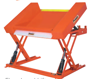
Floor Level Lift & Tilt Table