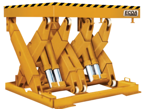
MLTDL Double-Long Series