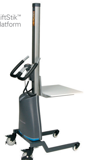
LiftStik™ With Platform