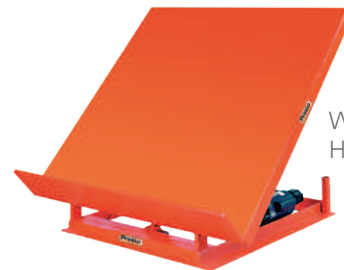
Wide Base Fixed Height Tilter