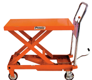
XP Series Portable Manual Scissor Lift