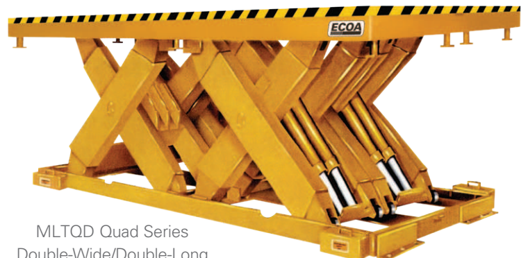
MLTQD Quad Series Double-Wide/Double-Long