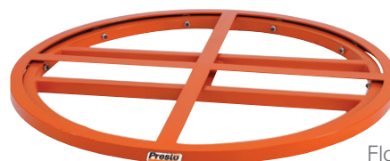
Floor Mount Turntable Ring