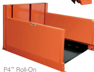
P4™ Roll-On Pallet Positioner