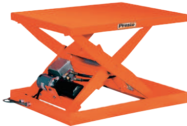
XS Series Light Duty Scissor Lifts