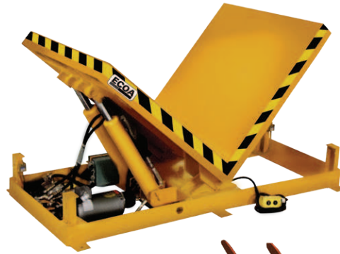
HUE Series Upenders

UT90 Series Upenders are available with platens or forks as well as optional v-cradle platforms.