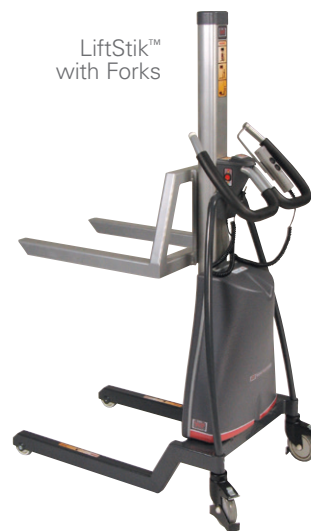
LiftStik™ with Forks