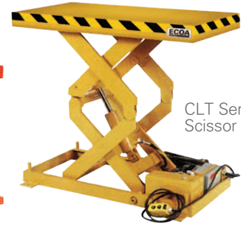
CLT Series Double Scissor Lifts