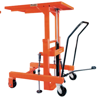
Hydraulic Cantilever Lift