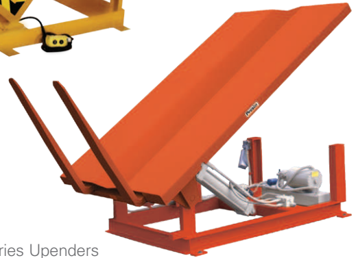
UT90 Series Upenders