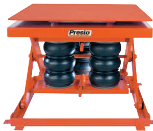
Pneumatic Scissor Lift & Rotate