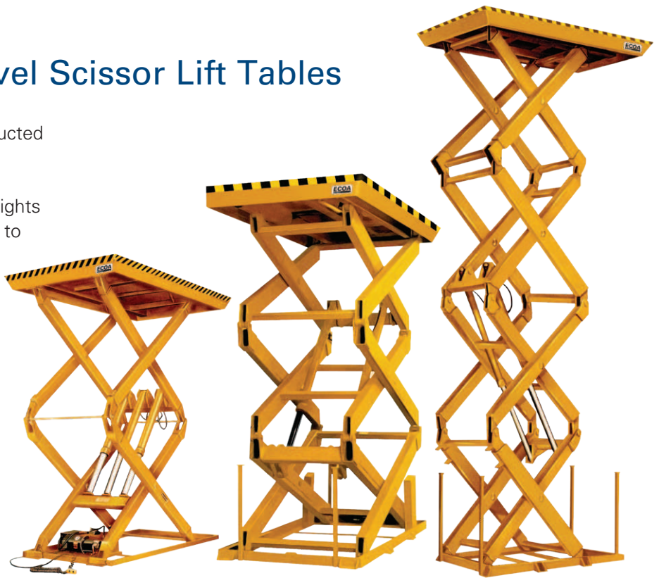
DSL Series Double Scissor Lift Tables

These high-travel double, triple, and quad scissor lift tables are designed and constructed for heavy-duty applications that require extended vertical travel. Multiple scissor mechanisms allow for maximum lifting heights in a small footprint. Capacities from 2,000 to 6,000 lbs. are available with lift heights from 70" up to 356".