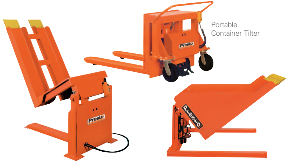
Portable Container Tilter

Floor Level units work with any style of container and can also be fed by a hand pallet truck.