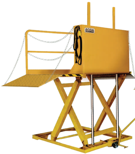
Trans-A-Dock TAD Series Surface Mount Loading Dock Lifts