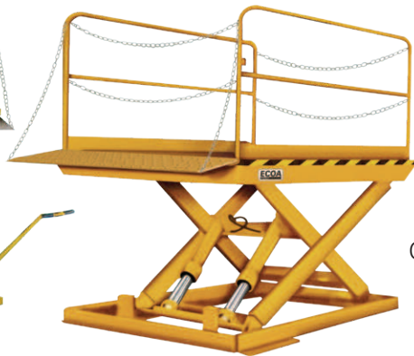
SizzrDok HLD Series Dock Lifts