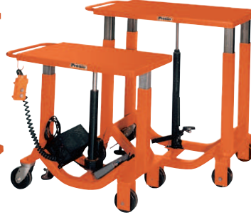
Hydraulic Post Lift