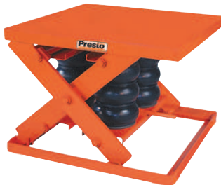
Pneumatic Scissor Lift