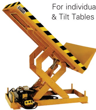
CLTLT Series SpaceSaver Lift & Tilt Tables

Fixed Height Tilters are also available and can be mounted on legs, work benches, or directly to the floor.