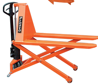
Manual Skid Lifter