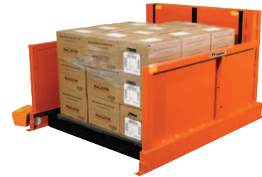
P4™ Roll-On Pallet Positioner