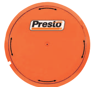
Low Profile Turntable