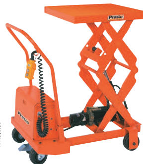
DBP Series Portable Double Scissor Lift