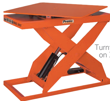
Turntable Mounted on XL Series Lift

Standard turntables can be mounted to the floor, to a fixed height stand, or to a lift table.