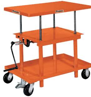
Mechanical Post Lift

Post lift tables are available in a variety of configurations including two-post, four-post, and cantilever. Choose 1,000, 2,000, or 3,000 lb. capacity units with platform sizes from 20" x 30" up to 30" x 60". Lifting and lowering options include mechanical hand crank, foot pump actuated and electrohydraulic.