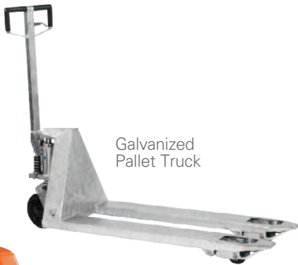
Galvanized Pallet Truck