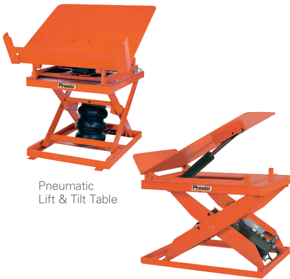
Pneumatic Lift & Tilt Table