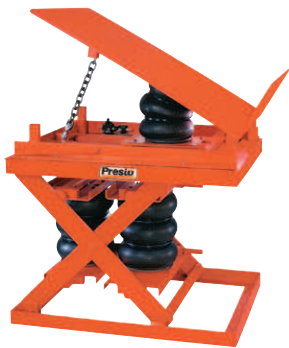
Pneumatic Scissor Lift & Tilt