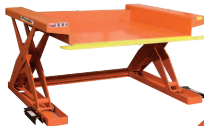
Floor Level Lift