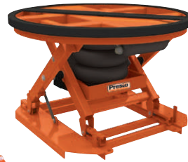
P3™ All-Around Pneumatic Load Leveler