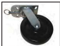
Optional 4 Position Swivel Lock