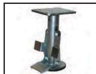
Optional Floor Lock