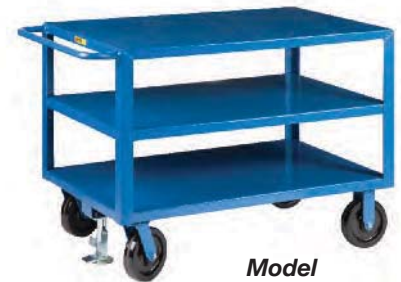
Model 3GH-8V2-5FL with Floor Lock Option