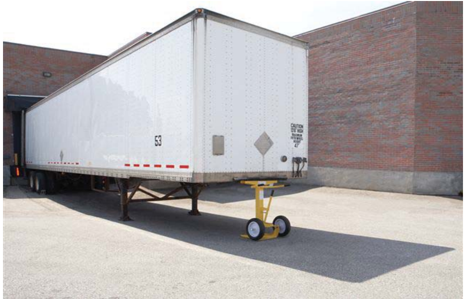
TMI's new EZ-Riser Trailer Stand

TMI has become a trusted name in managing dock and door safety, especially when it comes to preventing landing gear collapse, which has the potential to cause serious injuries and damage to people and equipment. TMI's Trailer Stands are the best solution to increase work place safety.