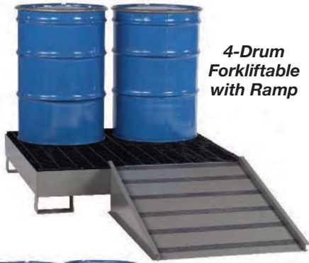
4-Drum Forkliftable with Ramp