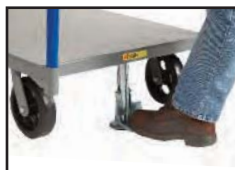
Floor Lock Option

Sturdy all-welded unit is constructed of a formed 12 gauge steel deck with extra reinforcement on underside. Removable pipe handle is 1-5/16" OD and has two cross braces. Two swivel and two rigid casters with choice of wheels. Durable powder coated finish. Ships fully assembled and ready for use.