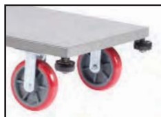
Rolling Corner Bumper