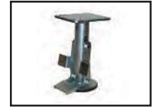
Optional Floor Lock -FL