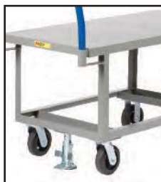
Floor Lock Option available on fixed height models, add -FL